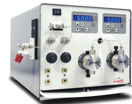
Pump shown with degasser

The included Gradient Board allows for autonomous binary gradient formation without the need for continuous computer monitoring and control. Serial commands may be used to directly set pump flow rates, start/pause, or monitor status. Additional features include control of two solvent-selection valves, multiple timed events, and leak detection.